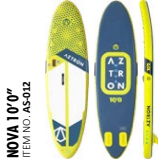
NOVA 10'0" ITEM NO. AS-012

SPECS/ LENGTH: 9'0" / 274 cm WIDTH: 28" / 71 cm THICKNESS: 4.75" / 12 cm VOLUME: 190 L