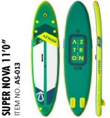
SUPER NOVA 11'0" ITEM NO. AS-013

SPECS/ LENGTH: 10'0" / 305 cm WIDTH: 32" / 81 cm THICKNESS: 6" / 15 cm VOLUME: 275 L