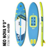
NEO NOVA 9'0" ITEM NO. AS-009

SPECS/ LENGTH: 9'0" / 274 cm WIDTH: 28" / 71 cm THICKNESS: 4.75" / 12 cm VOLUME: 190 L